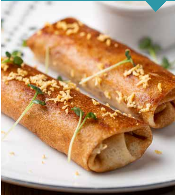
БРИОШ С ЛОСОСЕМ