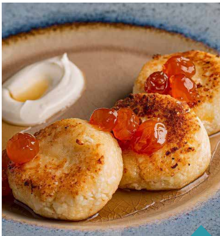
СЫРНИКИ С ВАРЕНЬЕМ