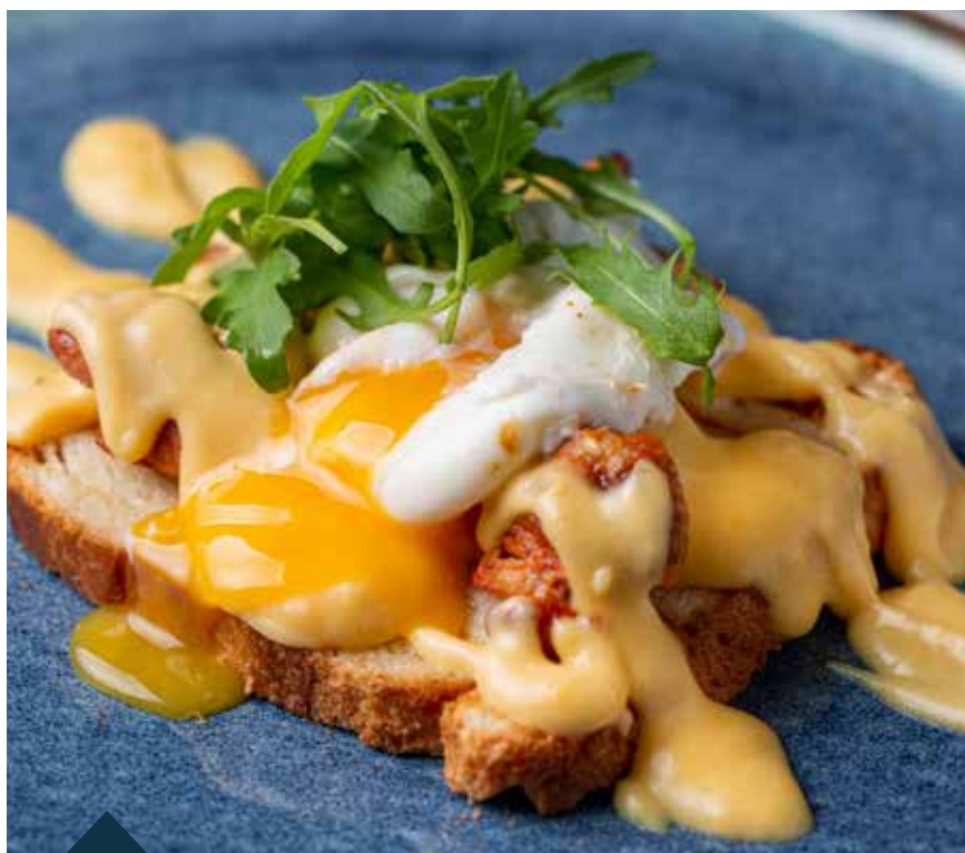
ЯЙЦО БЕНЕДИКТ С КУРИЦЕЙ